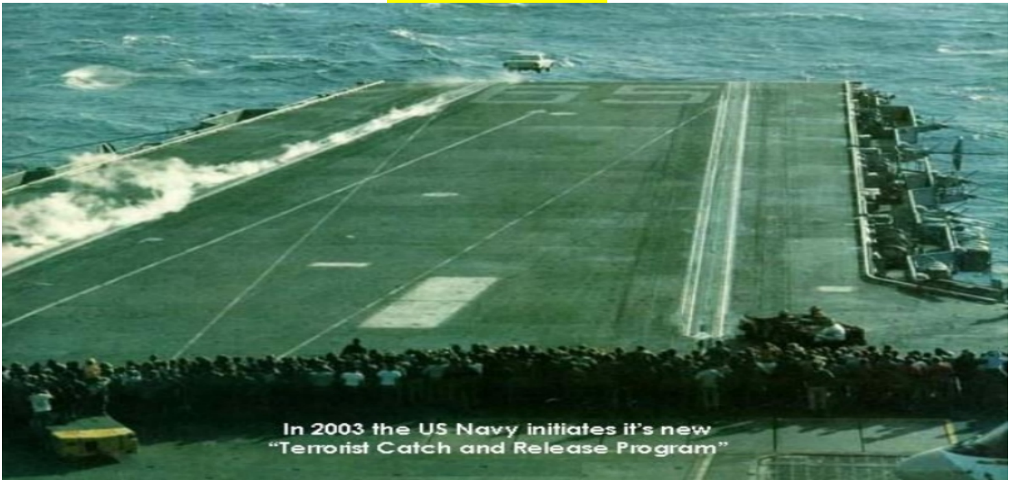
In 2003 the US Navy initiates it's new "Terrorist Catch and Release Program"