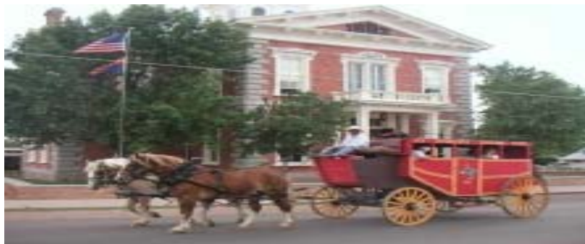
Tombstone Arizona - 'The Town Too Tough To Die'