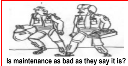
Is maintenance as bad as they say it is?